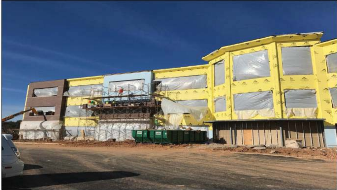
Main Administration Building