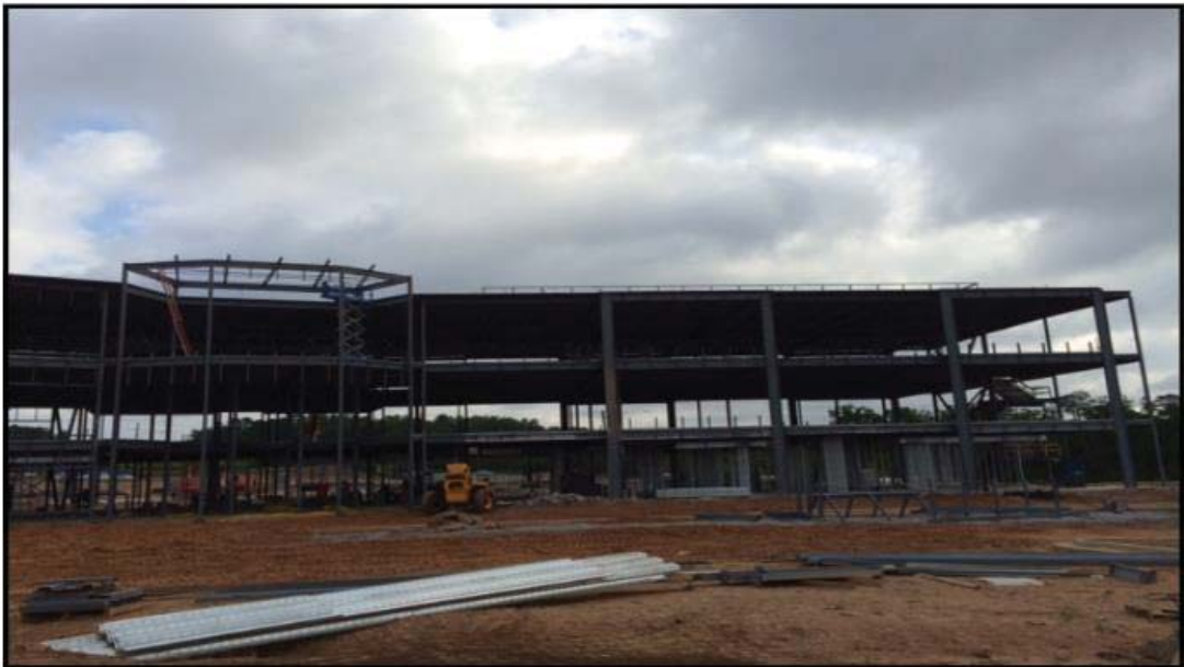
Main Building (Northeast)