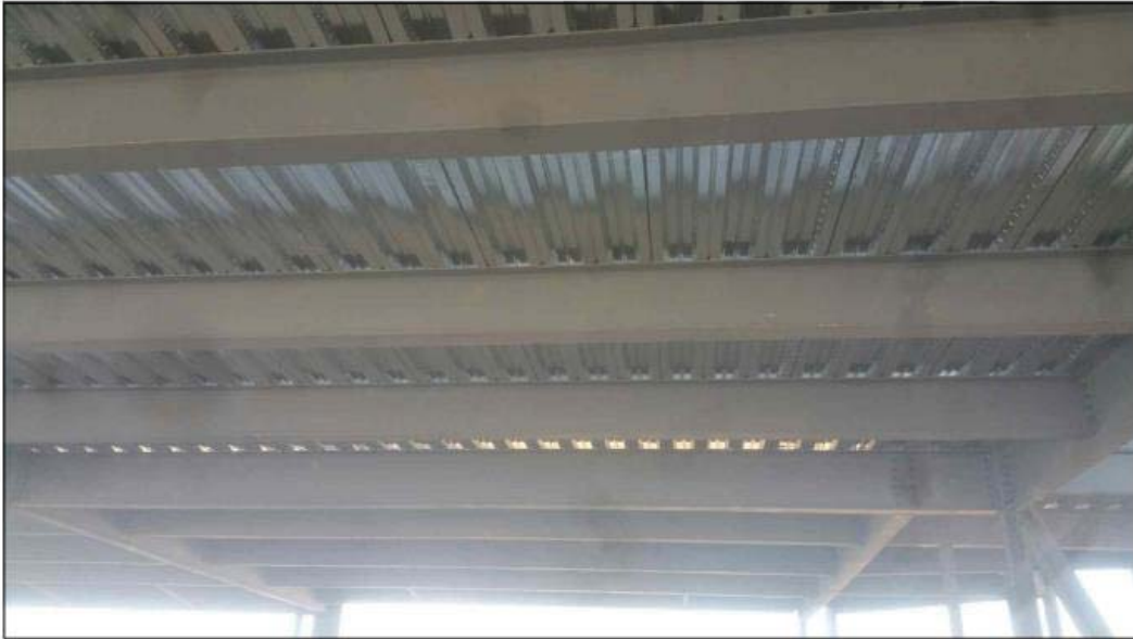
Metal Decking (Level 3)