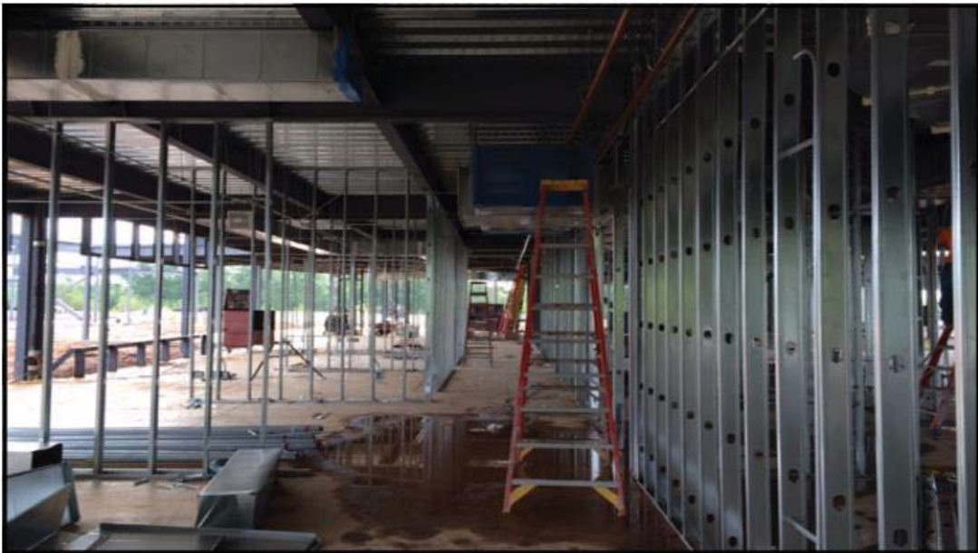
Corridor (Level 1)