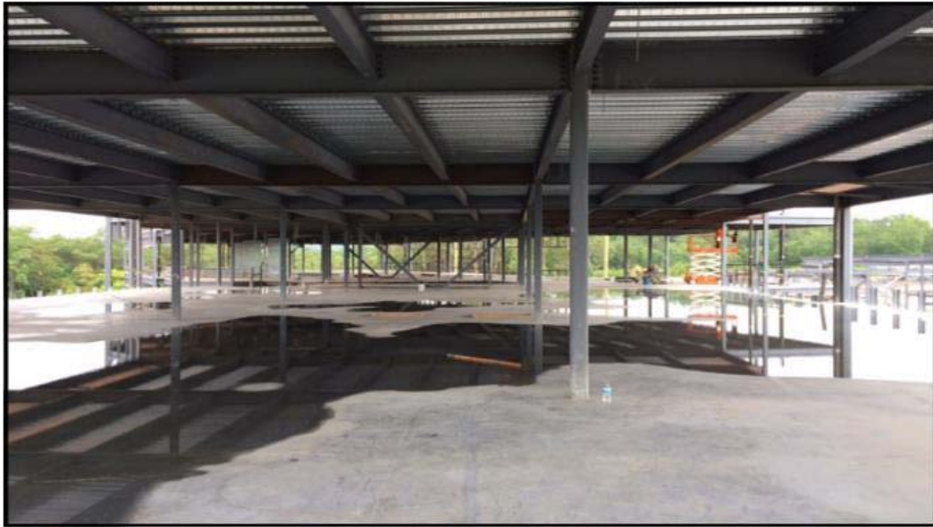
Main Building (Level 2)