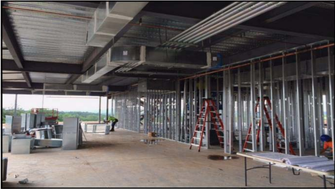
Metal Studs (Level 1)