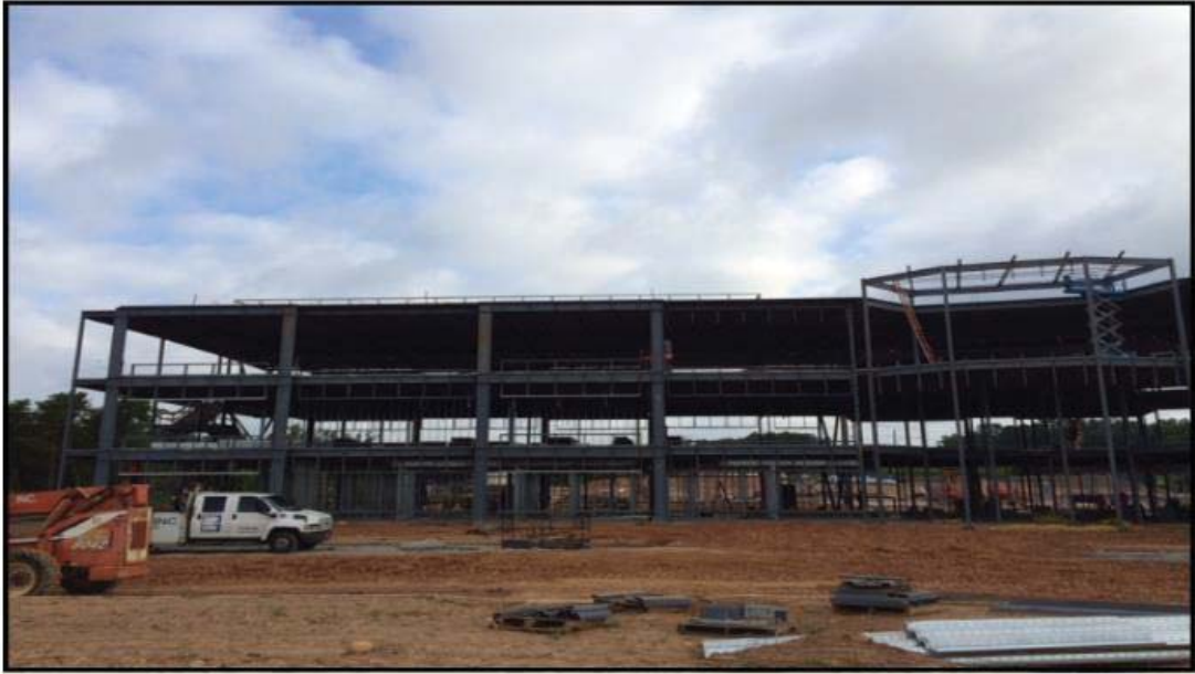
Main Building (Northwest)