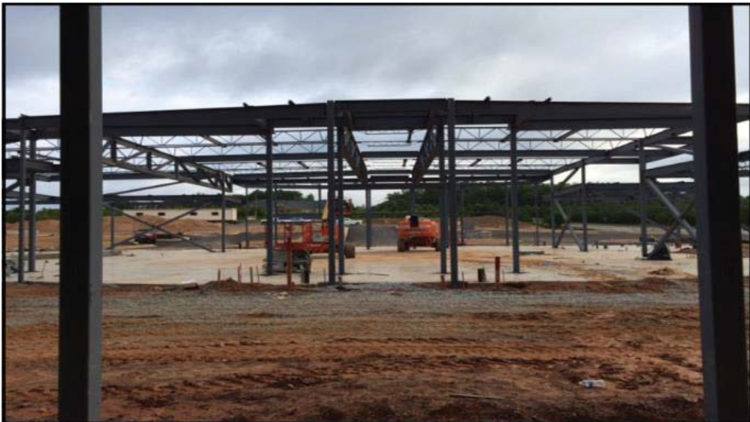
Auditorium Building (North)