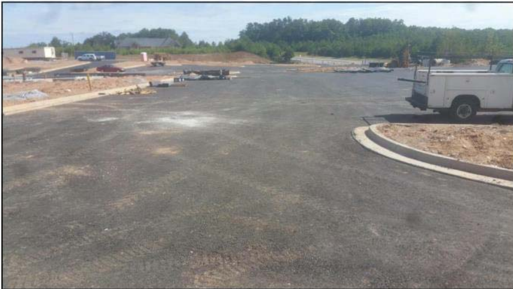
Asphalt Base Course