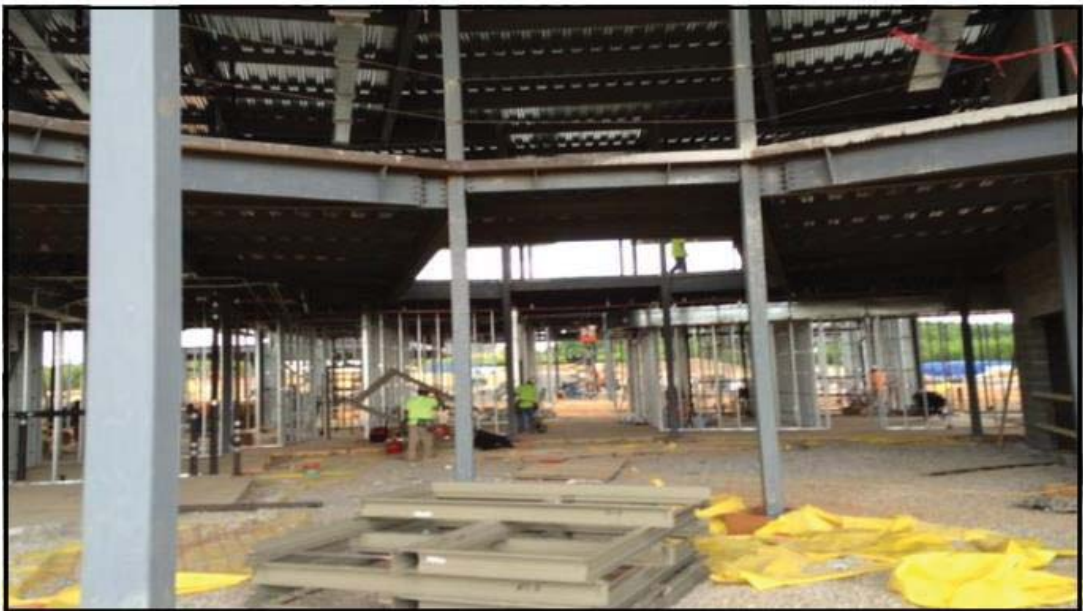
Lobby (Level 1)