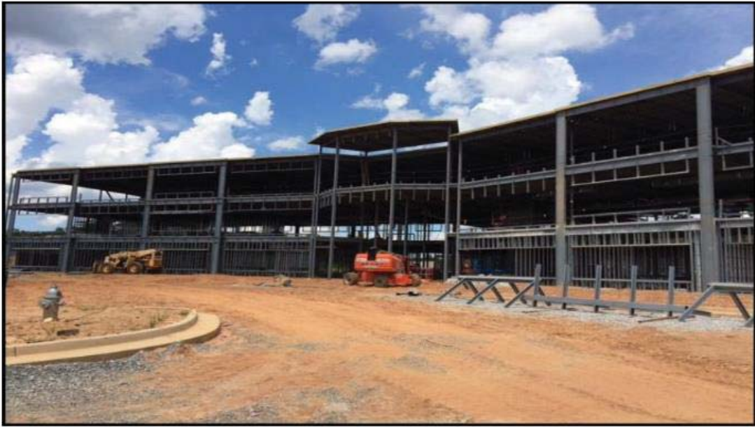
Main Administration Building