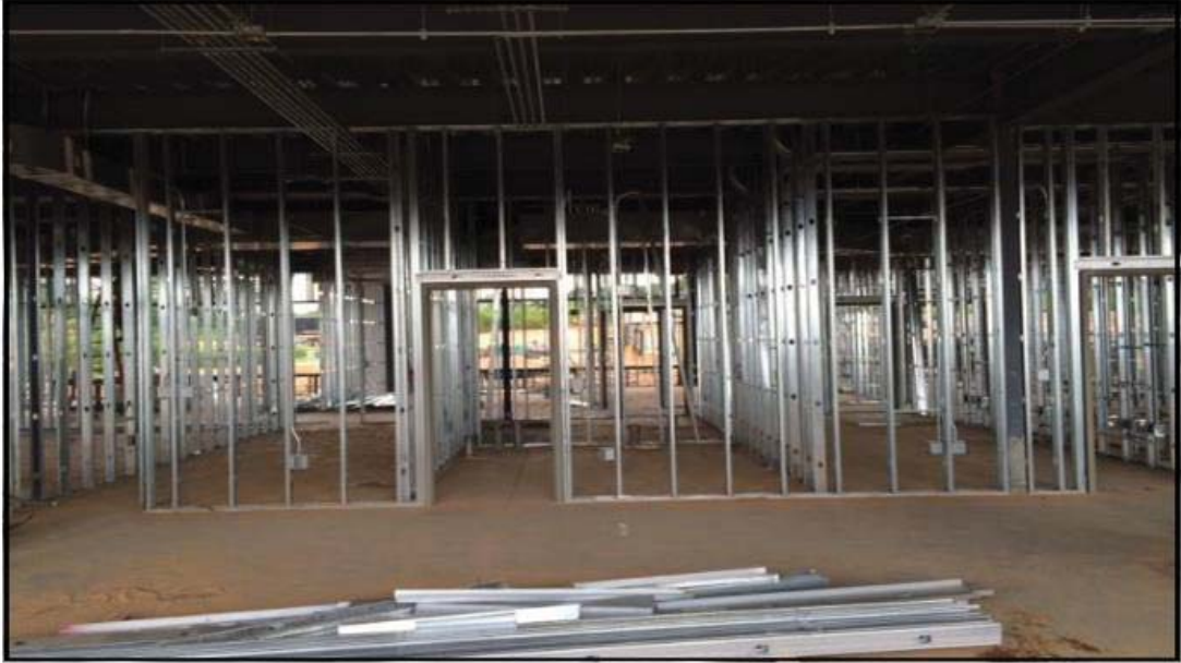
Metal Studs (Level 1)