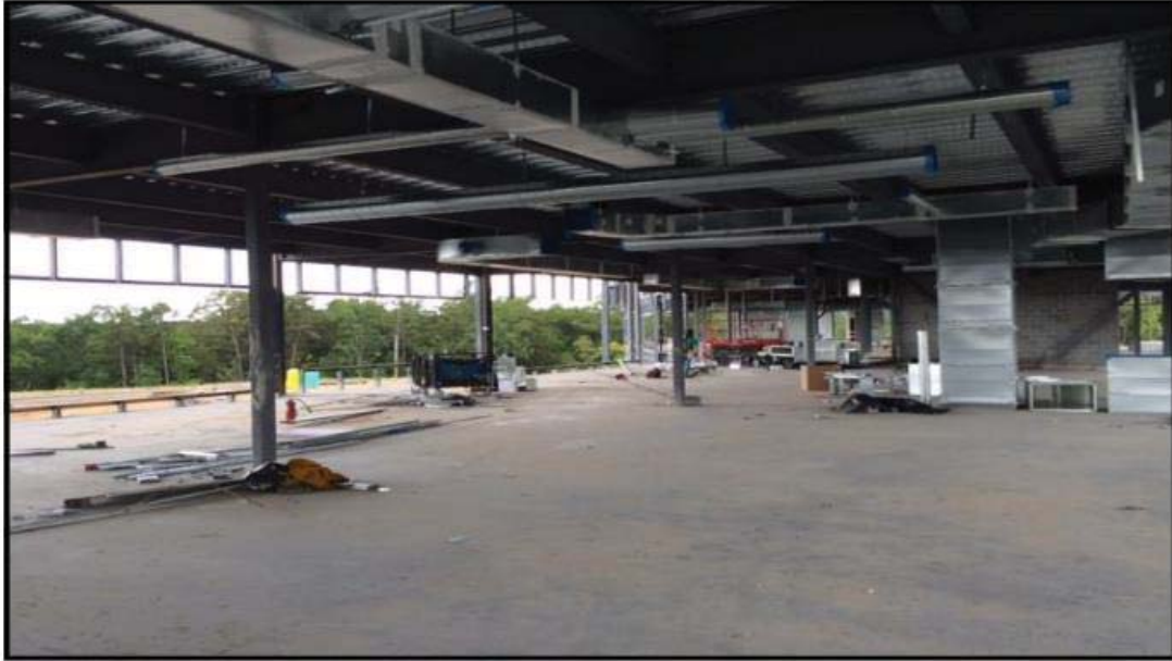
Level 2 (Ductwork)