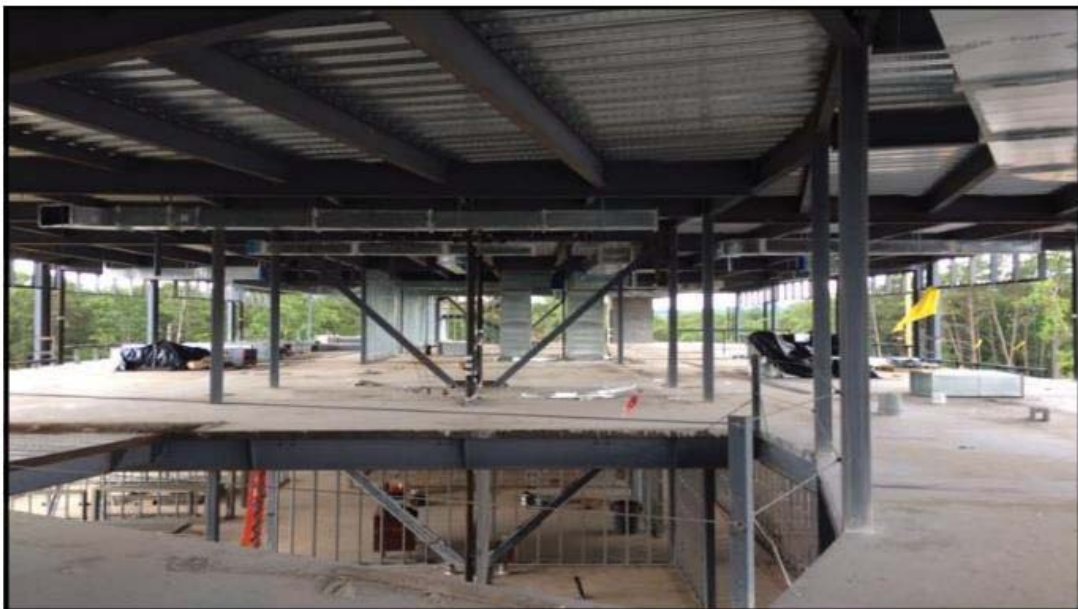
Level 2 (Balcony)