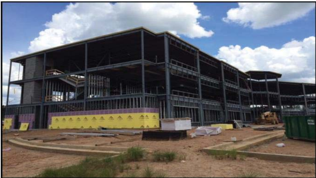
Main Administration Building