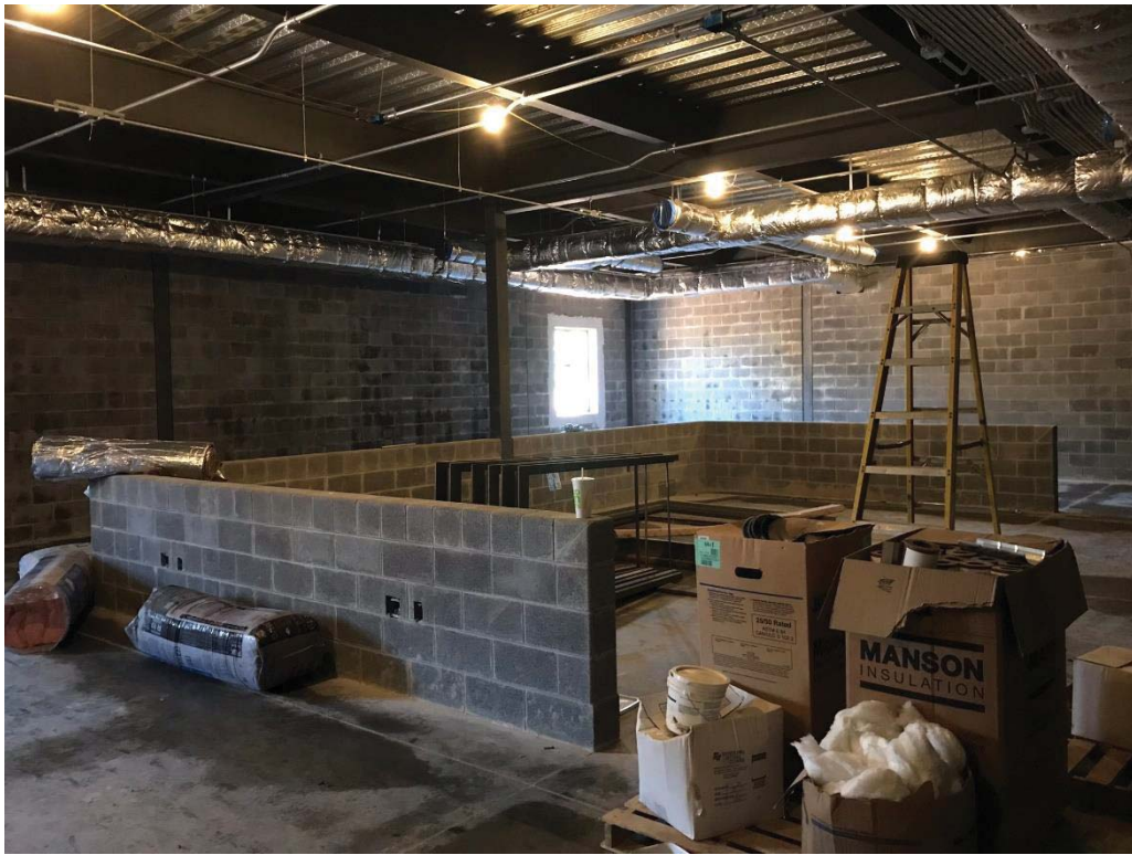
Family and Consumer Science