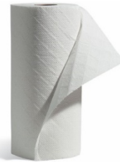
Paper Towels Need: (2) rolls