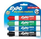
Colored Expo Markers Need: (1) pack