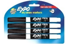
Skinny Black Expo Markers Need: (2) packs