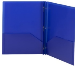
3- prong BLUE plastic pocket folder Need: (1)