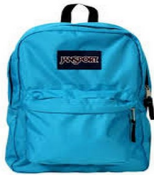
Backpack (No rolling backpacks please)