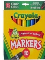
Broad Line Washable Markers Need: (1) pack