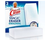
Mr. Clean Magic Erasers Need: (2) packs