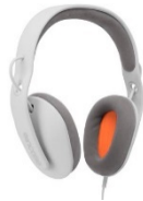
Headphones Need: (1) No earbuds Please label w/ your child's Name 😊