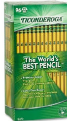
#2 Pre - sharpened Ticonderoga Pencils Need: (2) pkgs