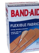
Band- aids Need: (1) box