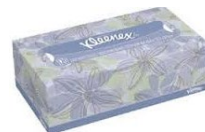
Tissues Need: (2) boxes