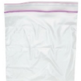
Baggies- Gallon Sized Need: (2) boxes