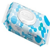
Baby Wipes Need: (2) pkgs