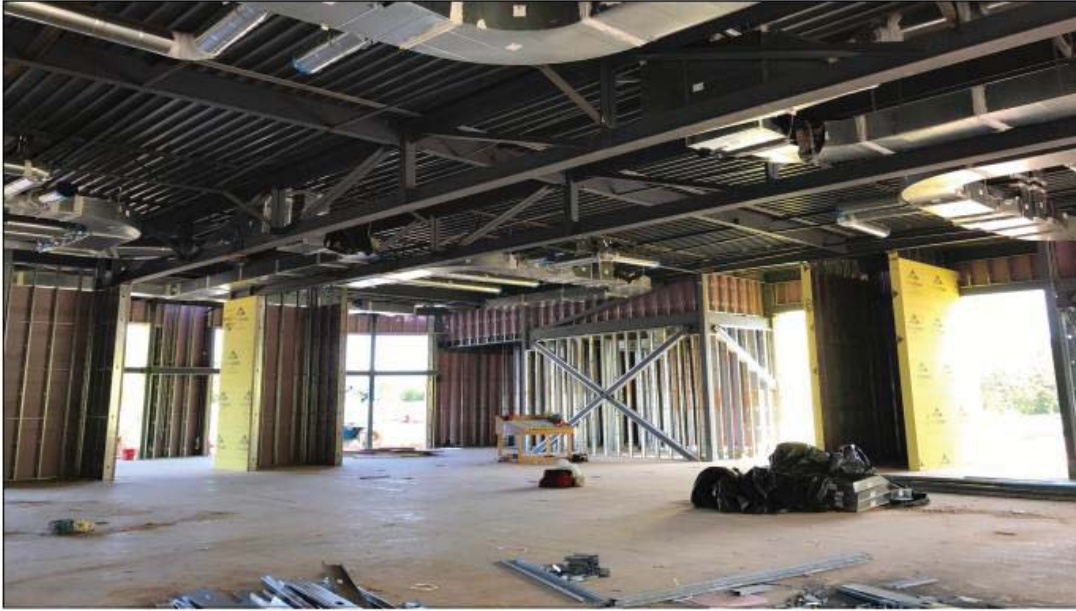
Interior Auditorium Building