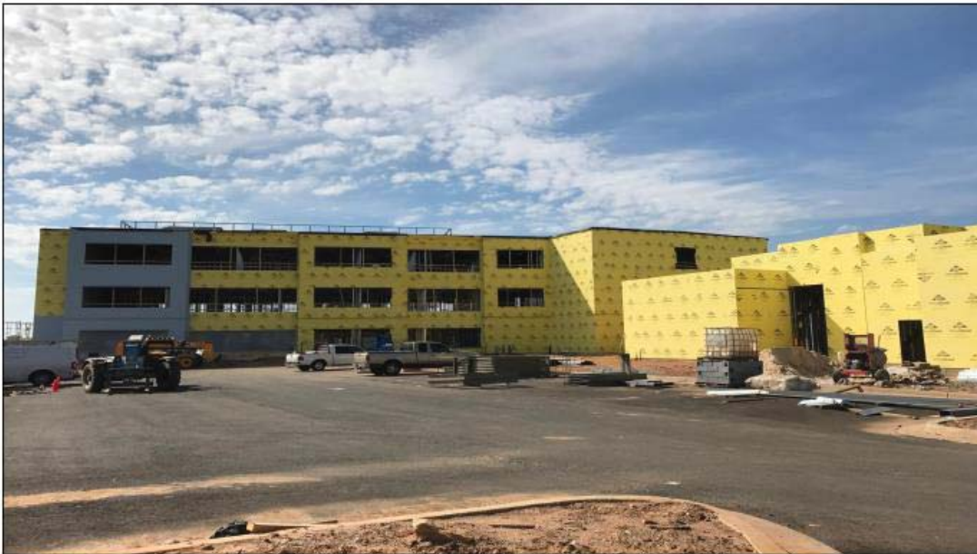
Main & Auditorium Building