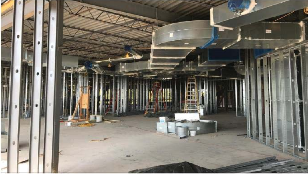
Upper Floor Lobby